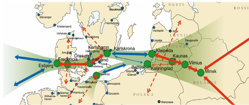
East-West transport corridor in the Southern Baltics area

Lastly, EWTC is a useful tool for governments to combine the efforts to facilitate needed improvements, for transport and logistics business community to speak with governments and cooperate for gaining competitive advantage. Agenda for developing skills and qualification of logistics specialists in the context of Asia-Europe connections would be a task for EWTC platform of researchers .