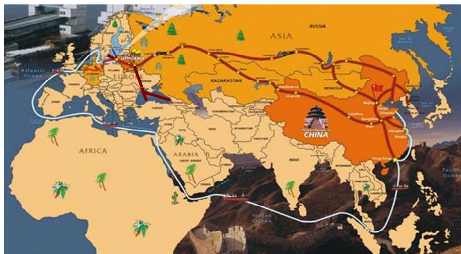
East-West transport corridor from the global perspective

EWTC is geographically defined infrastructure linkages and intermodal transportation route between Asian countries (China, Kazakhstan et al.), Russia, Belarus, Ukraine, countries of Black Sea Region, Southern Baltic Sea Region countries (Lithuania, Kaliningrad district, Northern Germany, Denmark, Southern Sweden) and the markets of Central, Western and Northern Europe.